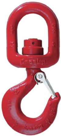
L-3322B Swivel Hooks with Bearing