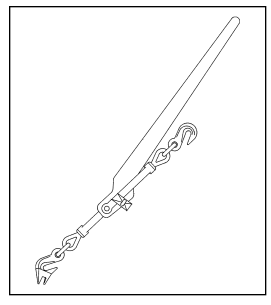
Lever Walking Type