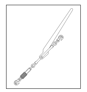
Lever Snubbing Type