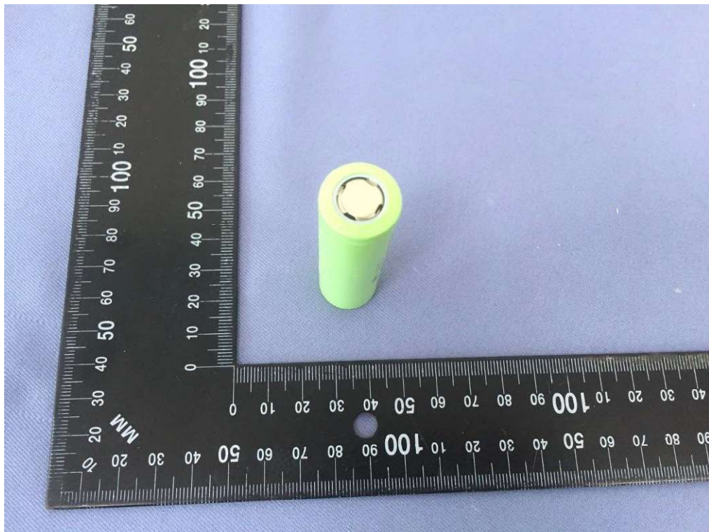
Fig.2 Overall view II of cell