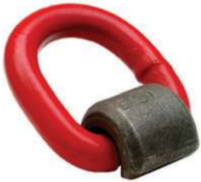
S-265 Weld-On Pivot Link