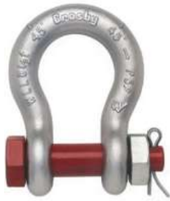
G-2130 / S-2130 Bolt Type Anchor shackles with thin head bolt - nut with cotter pin. Meets the performance requirements of Federal Specification RR-C 271G Type IVA, Grade A, Class 3, except for those provisions required of the contractor. For additional information, see page 475.