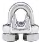
SS-450 (316 Stainless Steel)